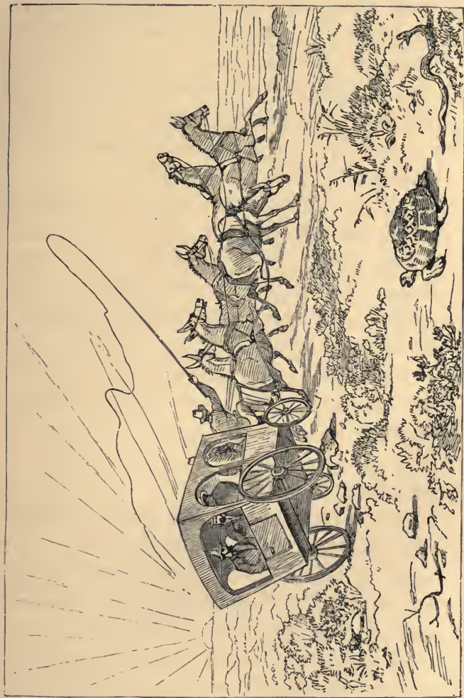
STARTING FOR THE HUNT.—PAGE 18.